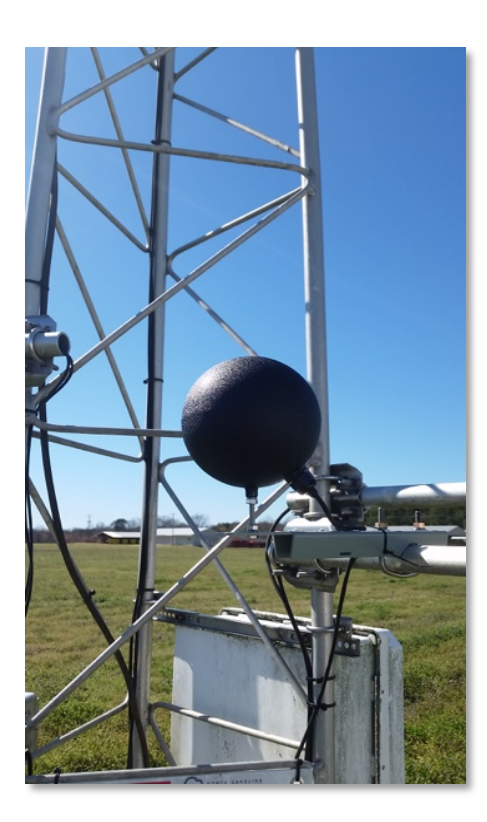
Black Globe Thermometer used to calculate heat stress in Rocky Mount

ECONet data are used for research and practical applications across North Carolina. ECONet stations are located in areas that lack federally managed weather stations. Use of ECONet data has proved beneficial to a number of applications, such as: