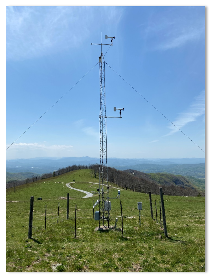
ECONet Station at BearWallow Mountain in Gerton, NC

and longest running state weather and climate monitoring networks in the country. The ECONet is housed at NC State University at the North Carolina Climate Office.