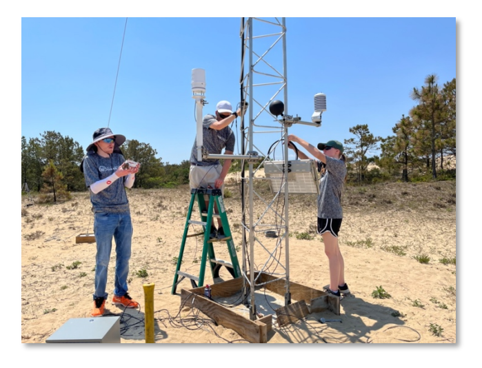
The ECONet Team installing a new station at Jockeys Ridge State Park, Nags Head, NC in May 2022.