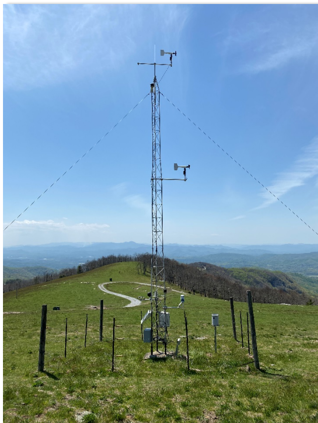
ECONet Station at BearWallow Mountain in Gerton, NC