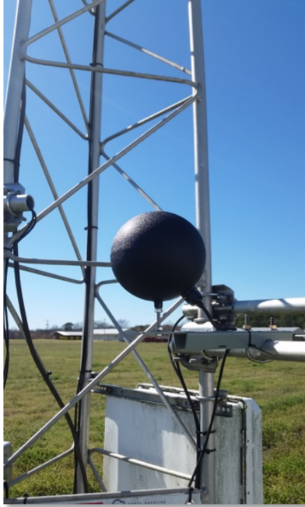
Black Globe Thermometer used to calculate heat stress in Rocky Mount

ECONet data are used for research and practical applications across North Carolina. ECONet stations are located in areas that lack federally managed weather stations. Use of ECONet data has proved beneficial to a number of applications, such as: